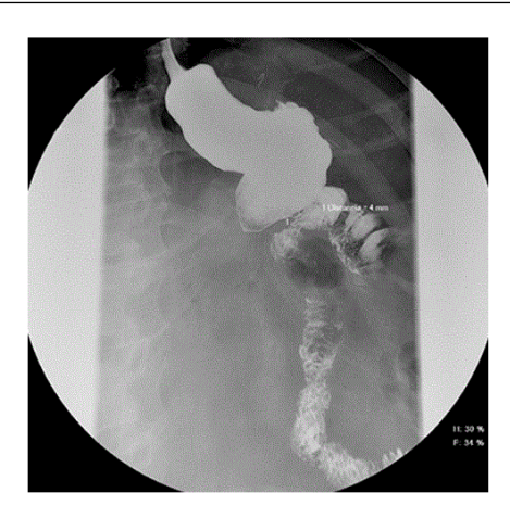
Figure 3: Gastrojejunal Estenosis 3 (4mm).

In the two-subsequent year evaluations, comorbidities have disappeared. Patient did not any longer require other treatments for hypertension or hypertriglyceridemia. Patient reached a weight loss of 53.4\ kg due to a procedure with a constant BMI of 26.8\ kg/m^2 and a weight of 86.6 kg.