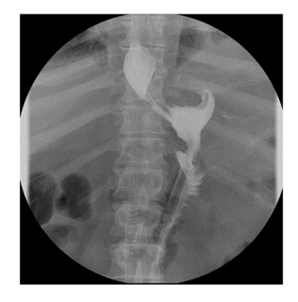
Figure 2: esophagogastric barium transit after surgery.