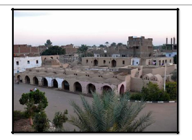
Figure 5: Isometric view of the New Gourna village.