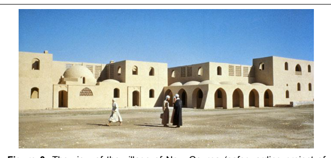
Figure 3: The view of the village of New Gourna (safeguarding project of Hassan Fathy's New Gourna village).

Evidently, the very significant aspect of delight can therefore be found at the site. The brown monochromatic color of mud strikingly contrasts with the color of the blue sky. This is turn provides it a delightful aesthetic appeal. Several figures such as arches, hemispherical dome, square and rectangular forms are carved out from the mud buildings. These are used as fenestrations for enhancing the ventilation system of the built-space (Figure 4).