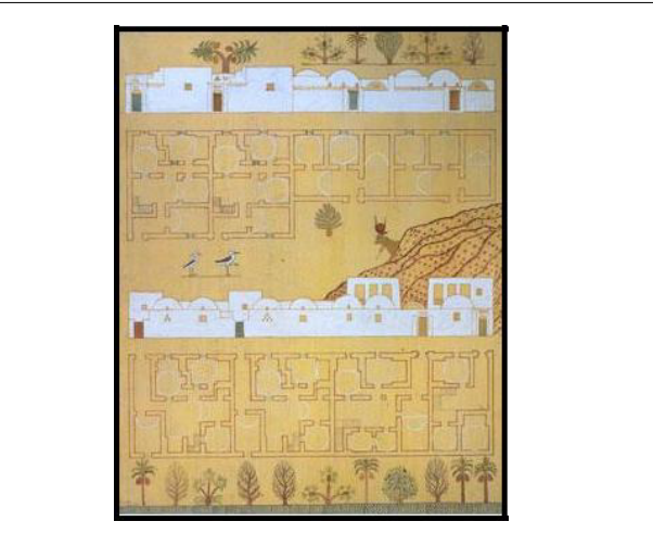
Figure 1: Plan of the New Gourna village (Chairman's award: Lifetime achievements of Hassan Fathy).

Other factors that have influenced Fathy's design include the climatic considerations, public health issues and ancient craft and workmanship techniques. One such material is the mud brick. Fathy has exploited the exceptional advantages and uses of earth as a full-