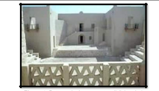
Figure 4: Patterns in the parapet wall (Iskander).

The village carries an essence of simplicity, innocence and honesty