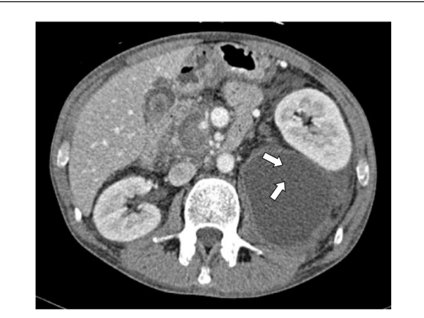
Figure 2: CTA showing pseudoaneurysm from SMA branch (arrows)