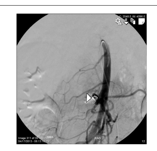
Figure 3: SMA angiogram with pseudoaneurysm pre-coiling (arrow) and post-coiling (arrowhead).

Two days after angioembolization, the patient had another episode of GI bleeding. Repeat EGD showed a small amount of blood mixed with bile flowing from the papillary orifice. However, repeat angiogram showed no evidence of active hemorrhage or pseudoaneurysm. An empiric GDA embolization was performed at this point in an attempt to control the hemorrhage. The next evening, the patient had an additional episode of melena as well as hematemesis prompting a repeat CTA which showed no active extravasation, but did show a distended gallbladder containing hematoma. At this point, the decision was made to proceed with an open cholecystectomy given the CT findings of a gallbladder distended with hematoma and continued GI bleeding without other obvious source, as there was the possibility of direct hemorrhage into the gallbladder. The operation was uneventful and the gallbladder was found to be filled with blood clots. The patient did well post-operatively and was discharge on postoperative day number four to home in stable condition without additional hemorrhage after cholecystectomy.