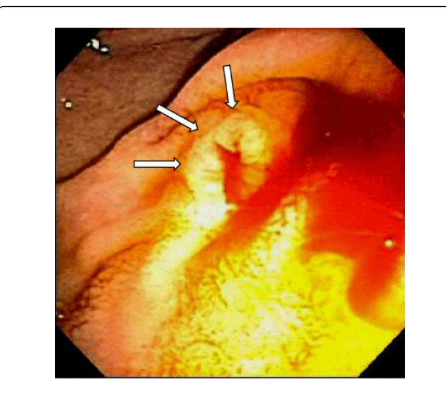
Figure 1: EGD showing fresh blood flowing out of the major papilla (arrows)

The patient continue to have a slowly down trending hematocrit over the next 10 days until a sudden drop accompanied by hematochezia. A CTA was repeated which revealed a pseudoaneurysm of a branch of the superior mesenteric artery (SMA) (Figure 2). A SMA angiogram was performed which confirmed an aneurysm of the second branch, which was successfully coil embolized (Figure 3).