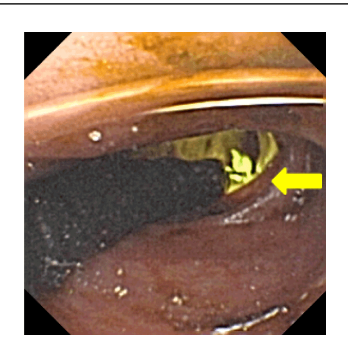
Figure 4: Endoscopic treatment visualization by the capsule endoscopy

Capsule endoscopy and small bowel endoscopy have greatly improved the diagnosis of the small bowel region. These diagnostic yields are more effective than other modalities, and these are central to the present algorithmic approach of small bowel hemorrhage [1], while tests for overt-ongoing bleeding are considered to be a