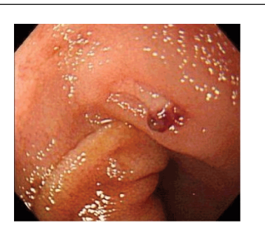
Figure 1: Hemostatic treatment of an ulcerative lesion

An 84-year-old male who had been habitually taking nonsteroidal anti-inflammatory drugs for low back pain was taken to the hospital due to loss of consciousness together with massive bloody bowel discharge. Emergency gastrointestinal endoscopy and colonoscopy revealed bleeding from the distal ileum. He was then referred to our hospital since small bowel hemorrhage was suspected. Capsule endoscopy was performed after abdominal contrast-enhanced computed tomography did not clearly reveal the origin of the hemorrhage. Six hours after ingestion of the capsule endoscopy, a realtime viewer was used to confirm that there was no hemorrhage in the upper half of the small bowel. Double balloon endoscopy with a transanal approach revealed the presence of blood in the entire large bowel and numerous small ulcers in the distal ileum. Hemostatic treatment of an ulcerative lesion involving an exposed blood vessel located 100 cm proximal to the ileocecal valve was performed (Figures 1 and 2). Since the capsule endoscopy and the balloon endoscopy met exactly at the lesion area (Figure 3), the endoscopic treatment was visualized by the capsule endoscopy (Figures 4).