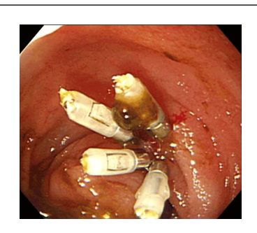
Figure 2: An ulcerative lesion involving an exposed blood vessel