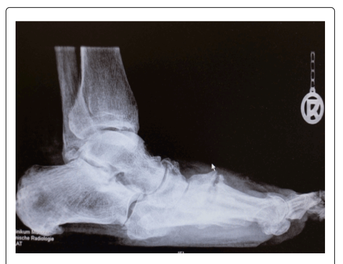
Figure 1: CN of the foot with destruction of the mid- and hind foot and irregular bone loss as well as bone formation, superficial plantar ulceration without deep infection (sanders type II, III, University of Texas Wound Classification IB), status after "internal amputation" of os metatarsale II. The patient was treated with resection of plantar and medial exostosis, debridement of ulceration, offloading until wound healing.

Foot deformities in Charcot feet affect the forefoot, mid foot or hind foot.