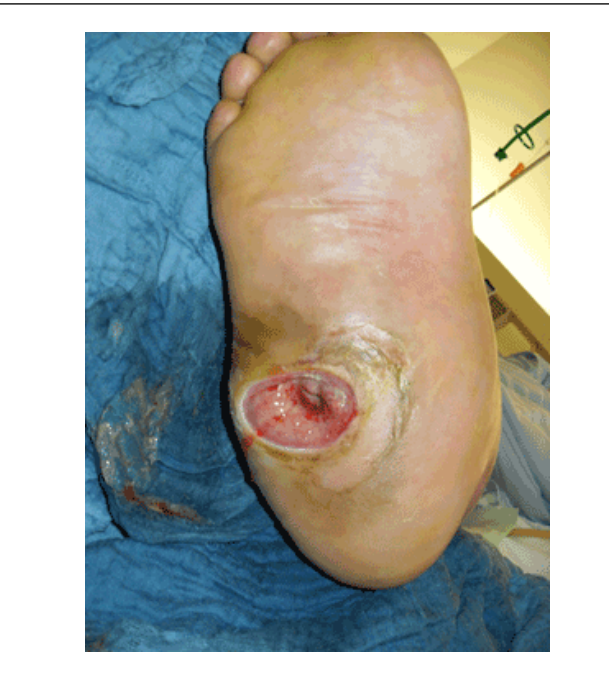
Figure 4: Putrid superinfected plantar ulceration with visible infected bones (University of Texas wound classification IIIb, Sanders II and III). This patient admitted himself at night to our clinic because amputation of the foot was planned in another hospital. At admission he showed a phlegmon of the foot and high elevated infection parameters.

Table 1: The University of Texas Wound Classification System.