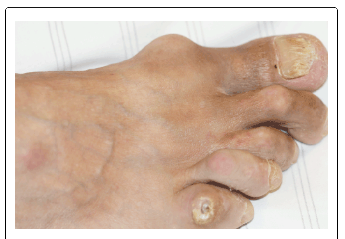
Figure 3: Contract claw toes with chronic ulceration of the proximal interphalangeal joint V in a patient with CN of the foot, severe polyneuropathy due to corticoid-induced diabetes mellitus because of rheumatoid arthritis. The patient was treated with resection of the ulcer, debridement and arthrodesis of the proximal interphalangeal joint using a k-wire that was removed after 3 weeks and antibiotic treatment for 4 weeks.

CN and ulceration of the mid foot show all kinds of malposition, instability and exostoses. To decide if a surgical intervention is necessary the stability of the foot has to be evaluated. Unstable situation will always lead to new ulceration. Hind foot infections are not as common as mid foot infections. Often we see deep infections penetrating Achill's tendon or the calcaneus because of the thin soft tissue layer.