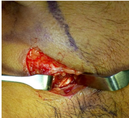
Figure 2 (a): Is a clinical picture showing the pterygomasseteric sling of patient.

alleviating the complications of treating low condylar fractures through an inferioparotid transmassetric approach.