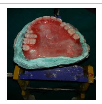
Figure 6: Maxillary twin occlusion.