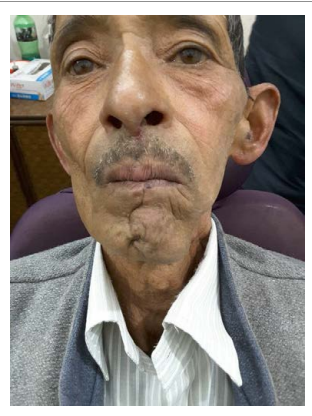
Figure 10: Postoperative photograph.

There were several physical limitations seen in hemindibulectomy edentulous patients like surgical skin grafts, deviated mandible, and unfavourable ridges. The present article explains successful management of hemimandibulectomy patient. Twin occlusal technique not only improves masticatory ability but also supports cheeks thereby improving aesthetics and phonetics [5-7]. This eliminates lateral stress that would destabilize mandibular denture. Implants also serve as another option in resected mandible but it is costly and technique sensitive [9]. The Guide Flange Prosthesis can be regarded as a training type of prosthesis. If the patient can successfully repeat the mediolateral position, the GFP can often be discontinued [10-13]. Another