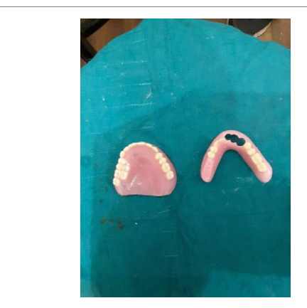
Figure 7: Final prosthesis.