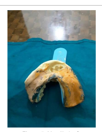
Figure 5: Mandibular fi.