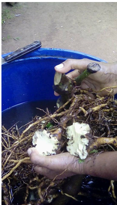
Figure 3: Farmer washing freshly harvested Kava.

The quality of different parts of a kava plant vary significantly, particularly the kavalactone content, and it is important that the different parts of the plant are kept separate. Keeping the different parts of the plant separate also helps to ensure the different parts are dried uniformly and that the different parts can be sold separately at the market. Different buyers may want different products but the recognized kava products are: