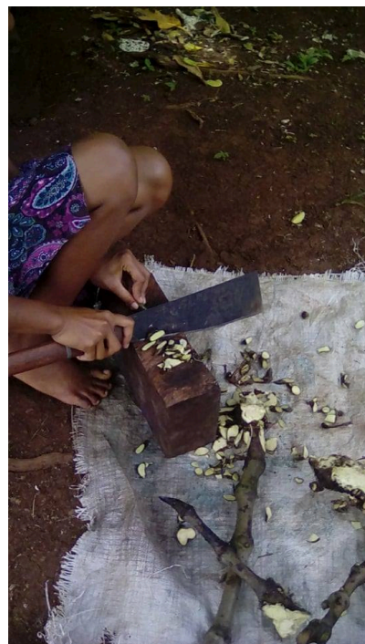
Figure 4: Farmer cutting Lewena chips.

To begin with, the roots (waka) are cut off and the waka should then be kept separate from other parts of the plant. The kava may need to be washed again as this process can expose dirt that has been hidden in the plant (Figure 4). It is important that sharp, clean knives are used and that the kava is kept off the ground to avoid contamination from soil, insects, grass, or foreign material like plastic or animal waste. The stems (kasa) are a low-quality product with low quantities of kavalactones and are not recommended to be sold or consumed.