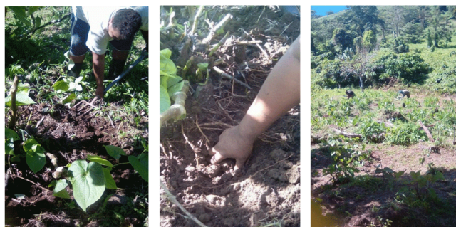
Figure 2: Farmers harvesting Kava in Tavueni, Fiji.

Harvesting of kava plants begins by cutting the leaves and stems of the plants above the first two nodes. If being used for direct planting or propagation the stems should be treated carefully so as not to damage them then separated into the different varieties ready for planting. Soil around the plant is loosened using a digging fork or stick to expose all surface and subsurface lateral roots before digging under the rhizome for the anchor roots to loosen the plant from the soil before lifting it off the ground. Make sure as many roots as possible are uprooted with the plant. During harvest, care should be taken to ensure there is little or no damage to the plant and no foreign matter, weeds or toxic plants are mixed with the harvested kava. Clean tools (forks, spades) between uses in different locations to stop the spread of any possible diseases. It is important to clean and sharpen knives before use to avoid introducing disease or damaging propagating material. Clean and store all tools in a covered and dry area (not on the ground) away from animals.