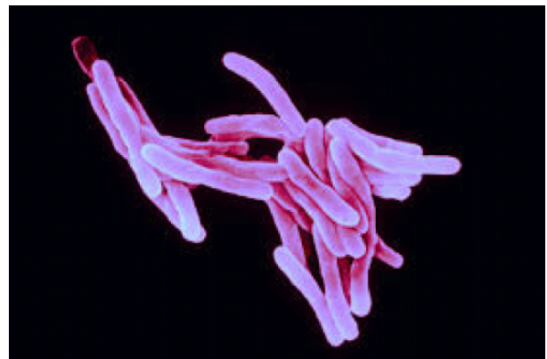
Figure 1: Mycobacterium leprae under electron microscope.

The first causative agent of leprosy disease in humans is M. leprae which has identified by microscopy technique [12] (Figure 1). It is a rod-shaped gram-positive acid fast bacterium which lasts up to thirty six hours at room temperature and 11-16 days in the host system for multiplication which can be considered very slow.