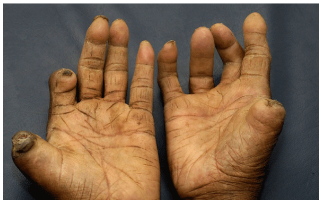
Figure 3: Effect of leprosy.

It is emerging day by day as one of the major infectious diseases all over the world including developing countries.