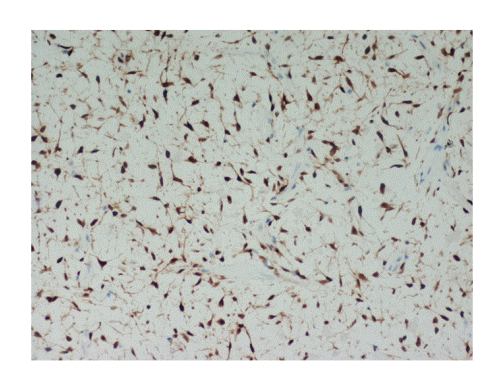
Figure 5: Positive CDK4 results of tumor cells by immunohistochemical staining (original magnification, ×200).