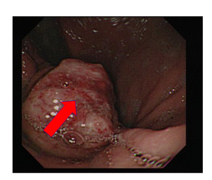
Figure 1: Esophagogastroduodenoscopy showed a gastric submucosal mass lesion with surface erosion at the middle body (arrow).

scan showed an intramural polypoid mass with a small ulceration at the greater curvature of the gastric middle body, characterized by heterogeneous fatty density (Figure 2). Meanwhile, chest CT scan revealed an enlarged poorly-enhanced hypodense mass with a lobular contour in the anterior mediastinum (Figure 3).