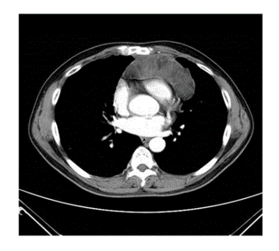
Figure 3: Chest computed tomography showed an enlarged lobule-contoured poorly- enhanced hypodense mass in the anterior mediastinum.

During laparotomy, a partial gastrectomy was performed to prevent tumor bleeding with achieving negative margin. An excised submucosal tumor sample ( 1.8 \times 1.7 \times 0.6 cm) appeared yellow-white