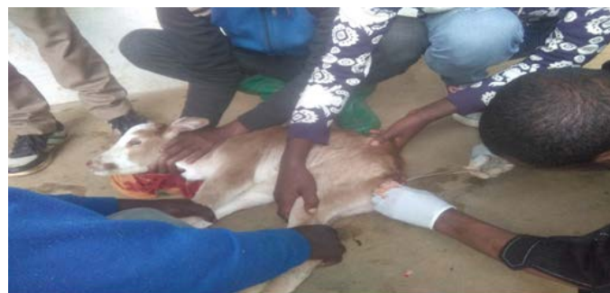
Figure 3: Surgical procedures performed in the district.