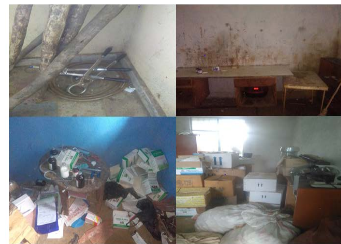
Figure 5: Drug stores and clinic rooms.