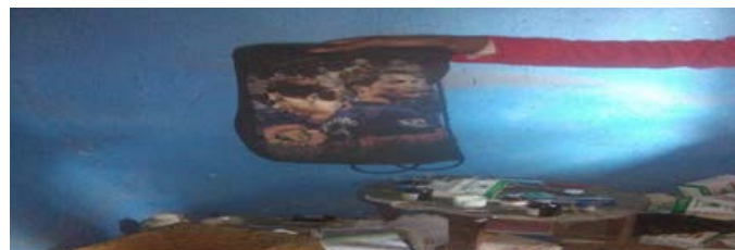
Figure 4: A bag that was used for carrying drugs.