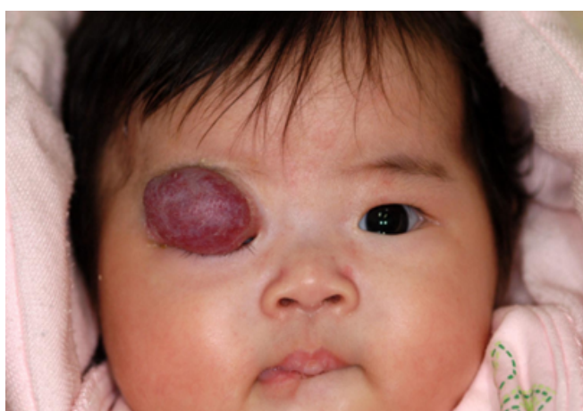
Figure 3: The lesion continued to grow despite intra-lesional steroid injection

She was initially treated with 3 intralesional steroid injections on a monthly interval (0.2 mL of 4mg/mL dexamethasone was injected superficially and 0.3 mL of 40 mg/mL triamcinolone was injected into the deeper part of the lesion). However, the hemangioma continued to grow in size (Figure 3).