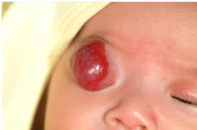
Figure 1: Large right upper lid capillary hemangioma measuring 2.5x2.5 cm