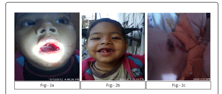
Figure 1: Patients images.

minutes to see any resumed bleeding which did not start again. Being Sunday next day they informed telephonically of child's well-being and no further bleeding and followed up on 17 December 2012 and was found to be well (Figure 2c).