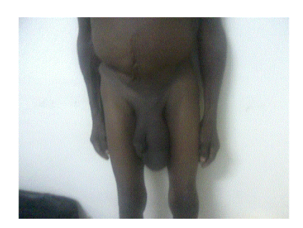
Figure 7: Left-sided giant inguino-scrotal hernia/ post-operative aspect one month and half later. The same patient as in Figures 4, 5