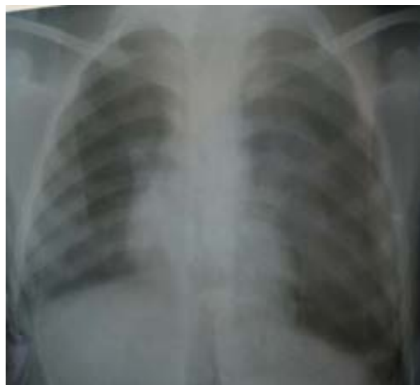
Figure 1: Chest radiograph normal 7 days after inhalation of foreign body.

In surgery department, the child was tachypnic and tachycardia.