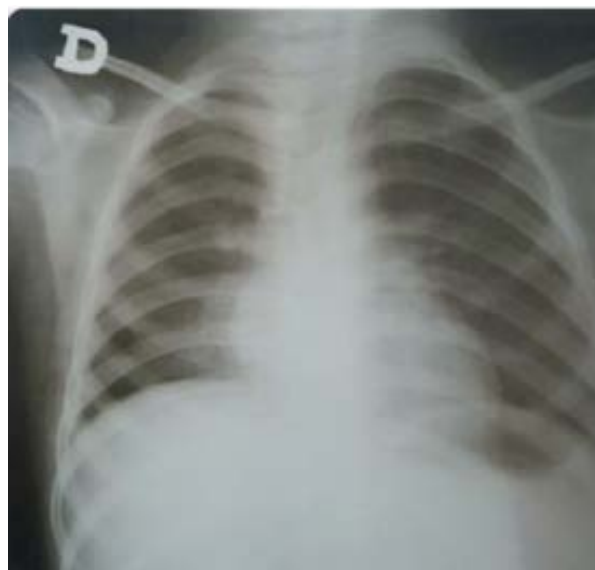
Figure 4: X-Ray chest showing lung without subcutaneous emphysema 15 days later.