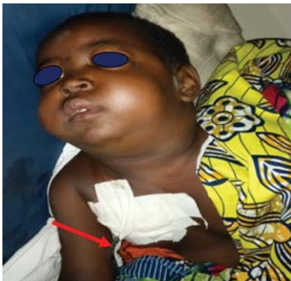
Figure 2: Subcutaneous emphysema with subcutaneous chest tube.