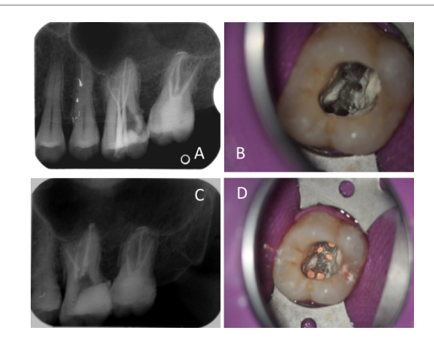
Figure 3: (A) The working length radiograph. (B) Access opening showing 5 root canal orifices. (C and D)The radiograph and photo after obturation.

The diagnosis consciousness of potential anatomic variations is essential for successful treatment. Combination of radiography and clinical examination under the microscope could encounter a higher incidence in the recognition of C-shaped canals [14]. Preoperative radiographs from different angle will contribute to identification of the root canal distribution [3]. The characteristic C-shaped roots are conical or square configuration by fused roots which may display an occlusoapical longitudinal groove on the buccal or lingual surface. Such narrow grooves may make the tooth prior to localize periodontal disease, which may be a diagnostic indication [15]. Access cavity preparation can obey the principle of orifice location. Adequate straight-line exposure of pulp-chamber floor is very important to find all of the root canal