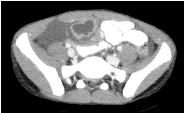
Figure 2: Axial CT scan of the lower abdomen revealed peripherally enhancing collection in right lower abdomen in close vicinity to mid anterior abdominal wall.