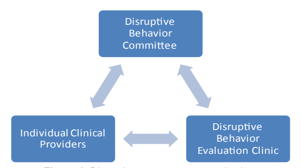
Figure 1. Disruptive assessment organization.

Table 2 summarizes provider responses regarding the utility (or anticipated utility) of the assessments. Members of the DBC and general mental health providers both ranked Detailed Risk Assessment and Risk Management Recommendations as highest utility. Where a number rank is shown more than once, it indicates a tie in number of responses for these categories.