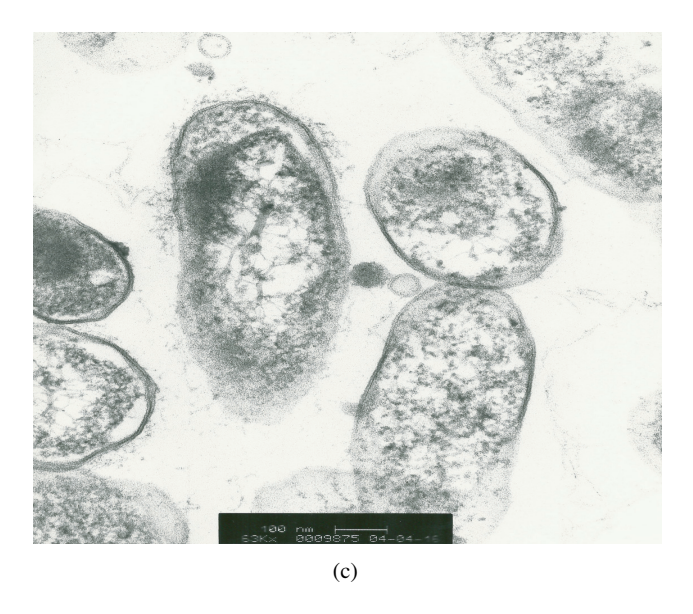
Figure 1: (a) Bartonella henselae colonies on a chocolate agar plate; (b) indirect immunoflourescence microscopy demonstrating cell culture grown B. henselae ; (c) scanning electron micrograph of B. henselae (176, 400X).

(more recent estimates have been revised to 25% of "atypical" cases) in human patient populations than was previously suspected [54]. In the past decade, numerous cases of neuroretinitis or neurobartonellosis optical neuritis have been reported and as these cases have recently been reviewed by Kalogeropoulos et al. [38]; these cases will not be included in this review.