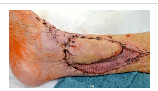
Figure 5: Zoom in-situ photo showing the posterior tibial artery with branch into the v y-flap.