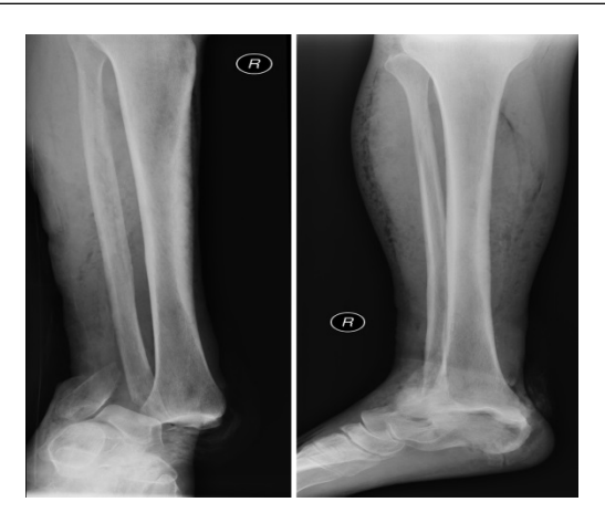
Figure 1: Two plane x-ray of the right ankle showing fixed dislocation fracture with entrapped air in surrounding soft tissue.

After immediate stabilisation of the vital functions, the patient was taken care in the operation theater. A reposition attempt by an emergency physician at the accident scene failed, therefore no other manoeuvre was undertaken in the emergency room (Figures 1 and 2).