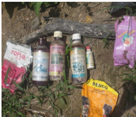
Plate 1: Insecticide containers found in a cabbage farm at Sefwi Bekwai in the tomato field at Akumadan in the Western Region of Ghana.

It was also revealed during the group discussion that some farmers use the empty pesticide containers for storing food items such as salt and palm oil, and as containers for kerosene. This practice appears to be common among farming communities in Ghana. NPAS [14] has also reported a widespread re-use of containers for storing food or water for humans or livestock.