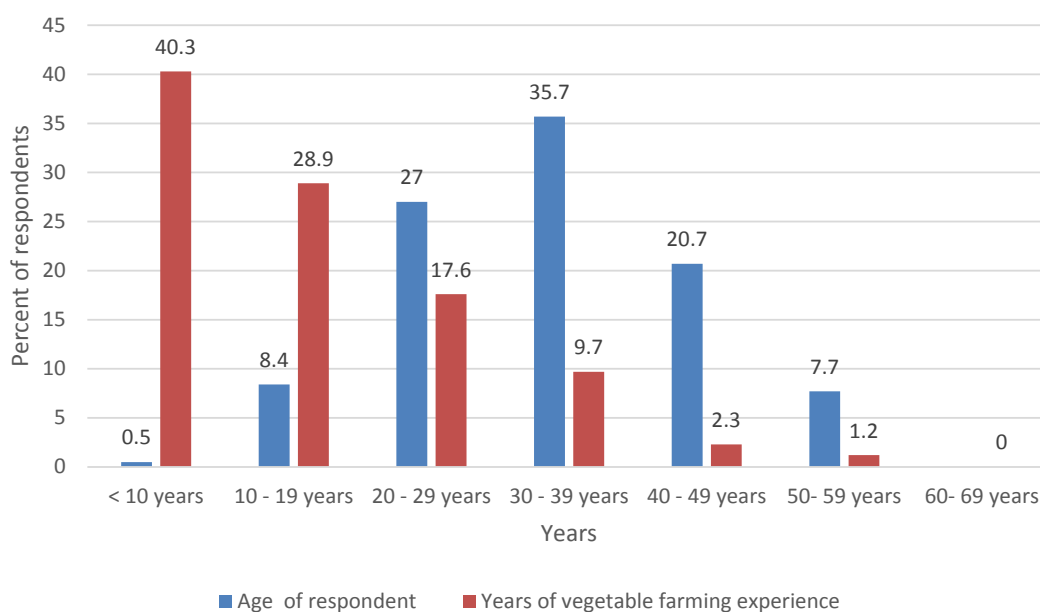
Figure 1: Household and farm characteristics of respondent farmers.

Continuous use of the same pesticide against a particular pest can lead to the development of resistance by the pest against the pesticide, thereby rendering the pesticide ineffective [19]. Unfortunately, this is the currently being practised by most of the vegetable farmers (77.4%) in the surveyed communities and perhaps several other parts of Ghana. Field observations showed for example that, in Sefwi Bekwai, a large cultivated cabbage farm had been abandoned by a respondent prior to crop maturity. This observation is partly attributed to ineffectiveness of various pesticides applied on the field to control the diamond back moth that is the major pest of crucifers. The concerned respondent confirmed that he applied four different types of insecticides on the cabbage plants with the perception that diverse combination of chemicals might be more effective than a single type. After probing further, it was later discovered, that the 4 different insecticides that were applied had the same active ingredient and similar concentrations, albeit with different trade names, a fact that is hardly understood by the farmer.