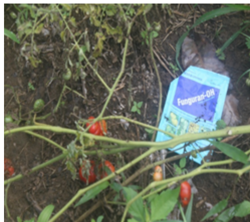
Plate 2: Fungicide container found in Ashanti Region of Ghana.