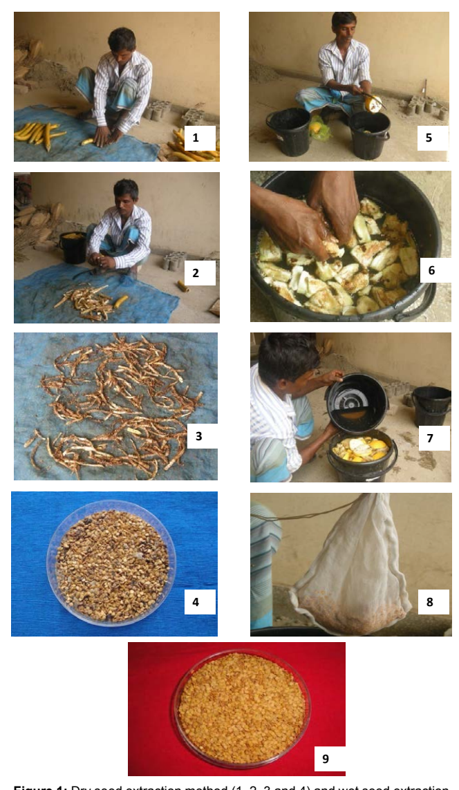
Figure 1: Dry seed extraction method (1, 2, 3 and 4) and wet seed extraction method (5, 6, 7, 8 and 9).

In dry seed extraction, the ripened fruits are harvested and dried in the sun for 5 days to become soften and shriveled. During drying of yellowish fruits, the skin colour turns to coppery brown. The fruits are then hand beaten or rolled to extract the seed. The outer covering was also peeled off and the flesh with the seed was cut into thin slices. Then the thin slices have been dried in the sun directly up to seeds were fully separated (Figure 1). Then seeds have been clean out through winnowing and dry out moisture content of 8 % or below before