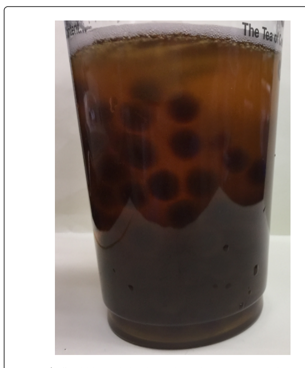
Figure 1b: "Bubble tea" drink made with tapioca particles (arrows), sugar, and water.