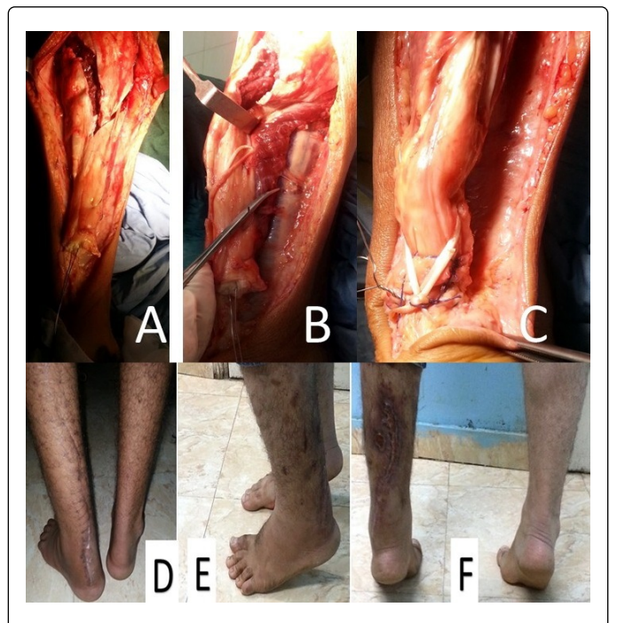
Figure 2: Multiple sutures augmenting the repair and the tendon transfer done using absorbable sutures.

of the paratenon, and then carful skin closure was done to avoid necrosis.