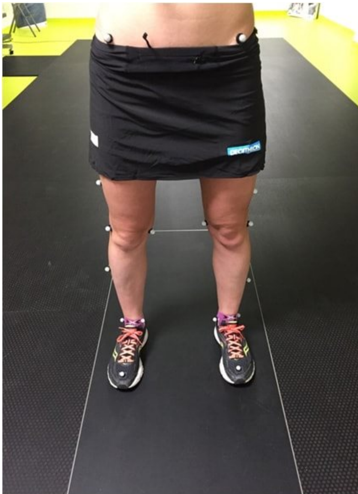
Figure 2: Plug-in-gait marker placement (anterior superior iliac spines, posterior superior iliac spines, lateral femoral epicondyles, thighs, shanks, malleoli, heels and second metatarsal heads).