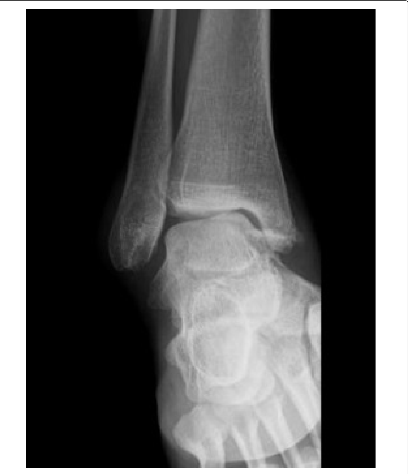
Figure 1: Anteroposterior X-ray of the ankle with significant talar tilt secondary to ankle instability.

The purpose of this review is to compare return to play (RTP) timelines and outcomes between open and arthroscopic treatments of lateral ankle instability in athletes.