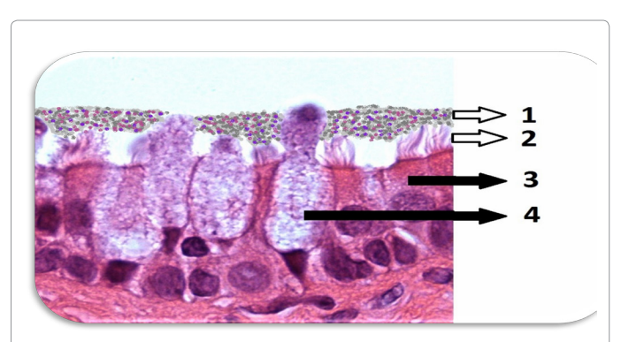
Figure 1: Photomicrograph of the lining of the maxillary sinus. 1- Mucus layer; 2- Cilia with periciliary liquid; 3- Ciliated cell; 4- Mucus producing goblet cell (HE section, X1000).

Histologically, the nasal and paranasal sinuses are lined with pseudostratified ciliated columnar epithelium that is approximately 0.3-5 mm in thickness [1,2]. This sinonasal epithelium is covered by a thin layer airway surface liquid (ASL) and contains specialized cilia immersed in a low viscosity periciliary liquid layer (PCL) [3]. Mucosal glands and specialized goblet cells are collectively responsible for mucous production and secretion [1,2] (Figure 1). Mucus is an important component of ASL and is positioned over the cilia and PCL serving as an efficient trap for inhaled particles which are transported to the nasopharynx by the synchronised, one-directional movement of the cilia [2]. Adequate mucociliary clearance (MCC) is also dependent on the hydration state of the ASL as well as on ciliary beat frequency [4]. In chronic rhinosinusitis (CR), there is disruption in the Cl transport which leads to dehydration of ASL and mucus stasis [5].