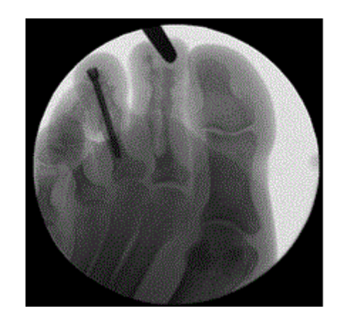
Figure 4: Intra-op image showing complete removal of screw.

A longitudinal dorsal incision was therefore made over the toe. The bone exposed and the screw end marked using an image intensifier. A small 2 mm burr was used to create a dorsal gutter. A small 1 mm k wire in a wire driver was used to clear the screw threads from the bone. Finally the screw was removed easily without causing a fracture. This permitted a better debridement and clearing of infected bone at the apex of the cannulated screw (Figure 4). Deep tissue samples were sent