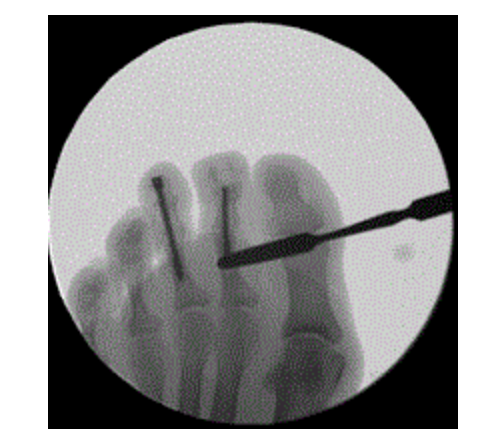
Figure 3: Intra-op image showing a broken screw head.