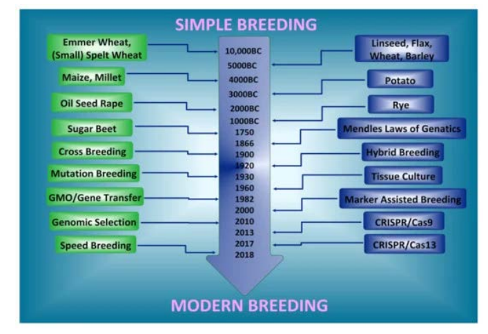
Figure 1: Historical milestones in plant breeding. For 10,000 years, farmers and breeders have been developing and improving crops.

Plant genome improvement is insufficient for developing new plant varieties using traditional breeding approaches. Since the 1990s, molecular markers have been employed to identify superior hybrid lines to overcome this barrier in plant breeding procedures. The artificial selection and breeding of this provided attribute by the plant breeder is required to improve plant phenotype for a certain desirable trait. In general, breeders focus on diploid or diploid-like qualities (maize and tomatoes) rather than polyploidy traits (alfalfa and potatoes), which have more complex genetics. Breeders prefer to use crops with shorter reproductive cycles, which allow for the production of multiple generations in a single year, resulting in faster artificial breeding of desired phenotypes than crops that reproduce only once a year or perennial plants that reproduce only once every few years (Figure 2).