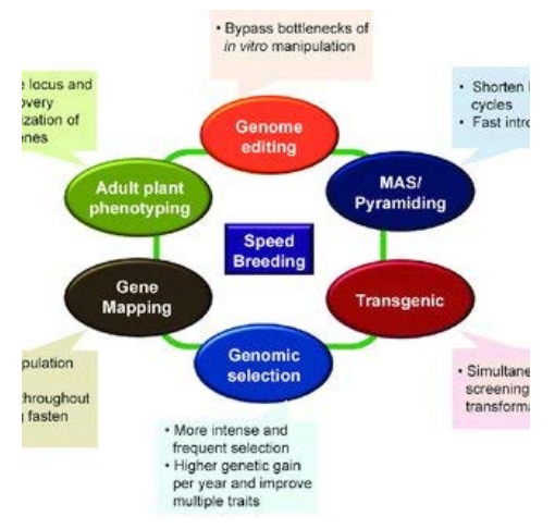
Figure 3: Speed breeding coupled with other breeding methodologies.

Light: An appropriate spectral range (400-700 nm) can be achieved through light-emitting diodes (LEDs) or other lighting sources as halogen lamps or sodium vapor lamps (SVLs). In addition to controlling light quality, light intensity should also be taken care of, so the recommended photosynthetic photon flux density (PPFD) of \sim\!450-500~\mu mol/m 2 /s. Photoperiod: Normally recommended photoperiod of 22 h with 2 h of darkness in a 24-h diurnal cycle. Temperature: The optimal temperature regime (maximum and minimum temperatures) should be applied for each crop. Humidity: A reasonable range of 60-70% is ideal and for crops adopted in drier conditions, can apply a lower level.