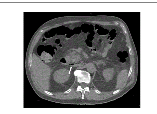
Figure 1: Type A retroperitoneal perforation. Axial CT discovered tiny air bubbles (arrow) between the duodenum, the head of the pancreas and the inferior vena cava.

There was no case where a perforation was not detected in the initial CT study but diagnosed during the follow-up CT study. Among 17 patients with RPP, the findings were as follows: six patients (35.3%) had a type A (Figure 1), six patients (35.3%) a type B (Figure 2), and five patients (29.4%) had a type C perforation (Figure 3).