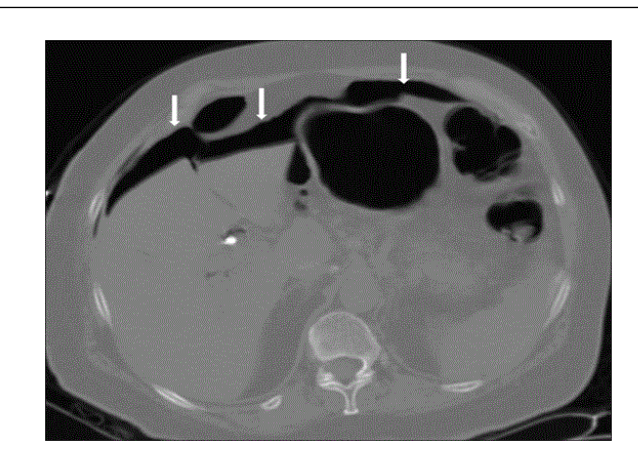
Figure 4a: Massive intraperitoneal perforation (type B); a) CT slice at the level of the upper abdomen demonstrated a large quantity of free intraperitoneal air anterior to the liver and stomach (arrows).

In four patients, an intra and extraperitoneal perforation was found. Three of them had type B IPP with massive intraperitoneal air (Figures 4a and 4b) and in one patient only a minimal quantity of air was found in the intraperitoneal cavity defined as type A IPP perforation. All patients with IPP also had a large quantity of retroperitoneal air (type C RPP).