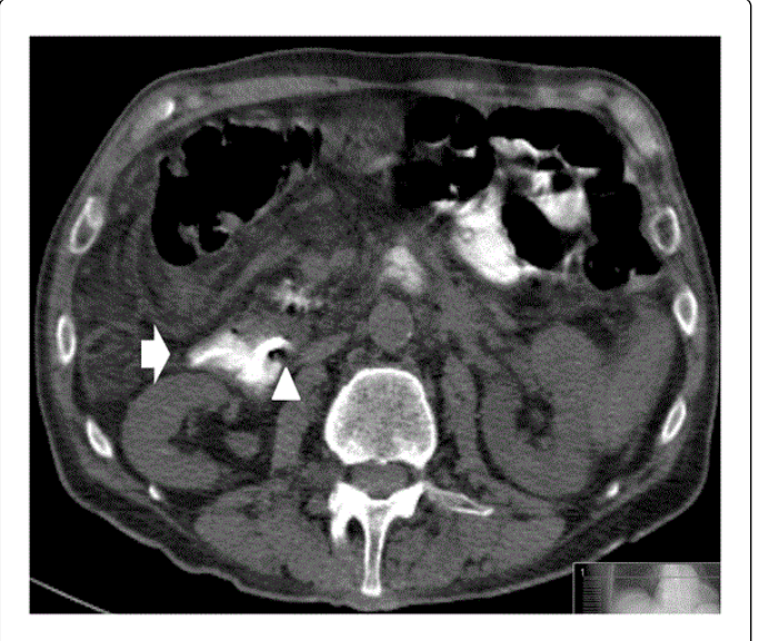
Figure 2: Type B retroperitoneal perforation. CT demonstrated a stent in the duodenum (arrow-head) and a moderate amount of air and contrast material laterally to the second part of the duodenum (arrow).