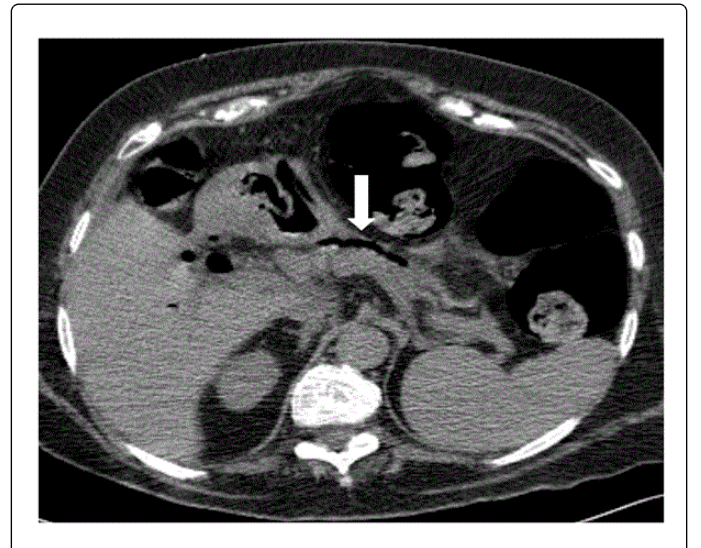
Figure 3: Type C retroperitoneal perforation. CT demonstrated free air anterior to the pancreas in the lesser sac.

In four patients, an intra and extraperitoneal perforation was found. Three of them had type B IPP with massive intraperitoneal air (Figures 4a and 4b) and in one patient only a minimal quantity of air was found in the intraperitoneal cavity defined as type A IPP perforation. All patients with IPP also had a large quantity of retroperitoneal air (type C RPP).