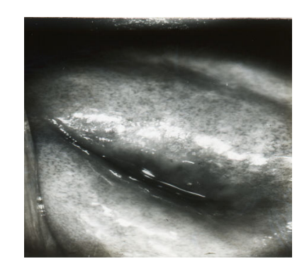
Figure 2: Vaginal bleeding, normal colposcopy. TOITU monocular colposcope, 250 W spot light, Neopan SS, blue filter.1/25 S.

inserting an extension tube between the lens and camera making the lens aperture controllable.