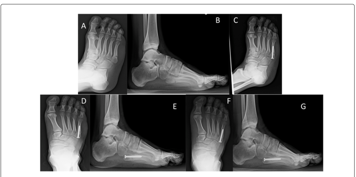
Figure 3: Nineteen-year-old female who sustained injury seen in (A) and (B), treated operatively with a 4.5mm partially threaded noncannulated screw. Post-operative radiograph is seen in (C). Patient was kept non-weight bearing for 2 weeks, and then allowed to weight-bear in a boot until 6 weeks post-op. Antero-posterior and lateral images of foot at 5 weeks post-op are seen in (D) and (E). The patient was then allowed to return to sport at 8 weeks post-op. Final post-op films at 12 weeks are seen in (F) and (G) (Figure 4).

Citation: Ryan Churchill W, Sherman IT, Carpiniello M, Postma WF (2016) The Approach to Proximal Fifth Metatarsal Fractures in Athletes. Clin Res Foot Ankle 4: 181. doi:10.4172/2329-910X.1000181