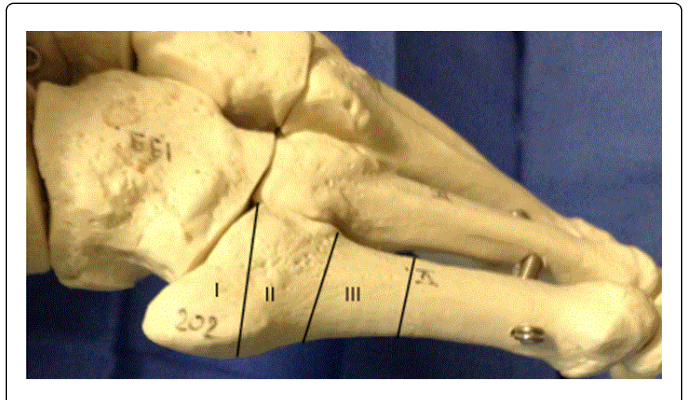
Figure 2: Model demonstrating three zones of proximal fifth metatarsal that fractures occur in I: Tuberosity; II: Metadiaphyseal (Jones fracture); III –proximal diaphysis (stress fracture).

typically extend from the lateral aspect of the tuberosity towards the cuboid [13]. They occur with inversion of the foot as the attachments of the plantar aponeurosis lateral cord and peroneus brevis avulse the tuberosity (Figure 2). Type II fractures or Jones fractures are those that begin at the lateral aspect of the fifth metatarsal and extend obliquely into the fourth-fifth intermetatarsal joint. This pattern is produced when a plantar flexed foot experiences a significant adduction force. Type III fractures are typically due to stress injuries related to repetitive overload that occur in the diaphysis just distal to the fourth-fifth intermetatarsal joint [17,18].