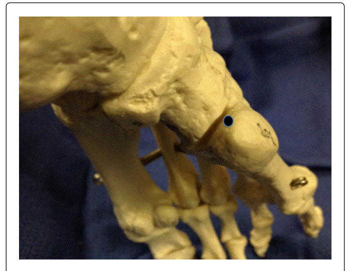
Figure 5: A model demonstrating the correct starting point (black dot) for the guidewire for an intramedullary screw in the "high and inside" position.

have been using headless compression screws recently as well. Preoperatively the medullary canal is measured and the largest sized screw that can be safely placed is recommended. We have found 6.5 screws generally to be too large in many cases, but 5.0 screws typically can be placed with relative ease. The screw is placed in the "high and inside" position in order to optimize screw length. Failure to achieve this starting point predisposes to shorter screw length with insufficient purchase distal to the fracture compromising stability and risking nonunion (Figure 5).