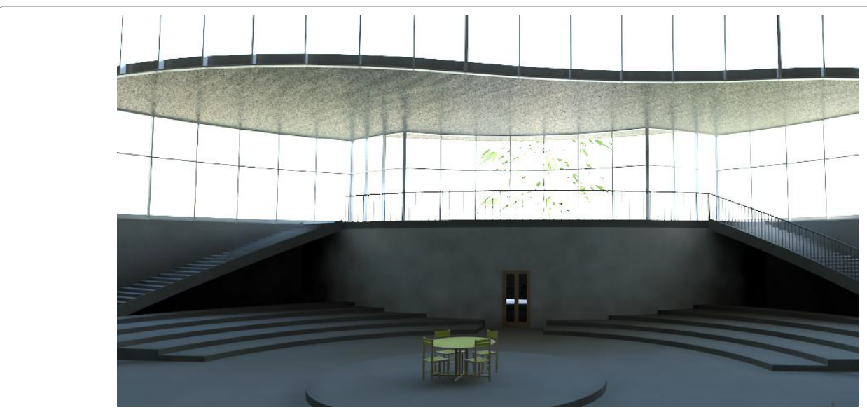
Figure 4: Schematic view of inside the main building.

Considering the big main building, we designed the area which leaders can have discussion on their religion and we assigned place for followers that they can sit inside and observe where discussion goes on, the primary reason for designing building is this place which they can give and take the idea from another religions, finally, they will reach to the point that one part should back off. Furthermore, occasionally it is necessary to dispute certain doctrines that are taught within the religious community. Some feel that this is wrong. Therefore, in this area we placed a circular desk where 4 leader can sit and debate (Figure 4) [20].