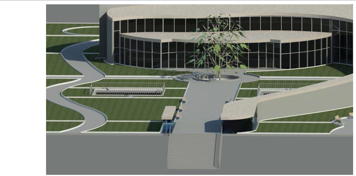
Figure 3: Schematic view of entrance and cedar tree.