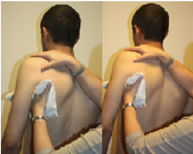
Figure 2: Scapular position modification: manually moving the scapula into elevation to assess its effect on the provocative test.

examples of humeral head position modification: A) Self- resisted depression; B) Therapist- resisted depression; C) Thera-band resisted humeral head depression, and assisting elevation (could be performed into flexion or abduction). External rotation consisted of 3 repetitions of light Thera-band- resisted external rotation, after which the provocative test was re-evaluated. Assisted elevation included 3 repetitions of Thera-band- resisted arm extension, followed by assisted arm elevation (flexion/abduction), after which the provocative test was re-evaluated.