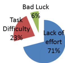
Figure 2: A Chart showing students' attributions of failure in tests and examinations.