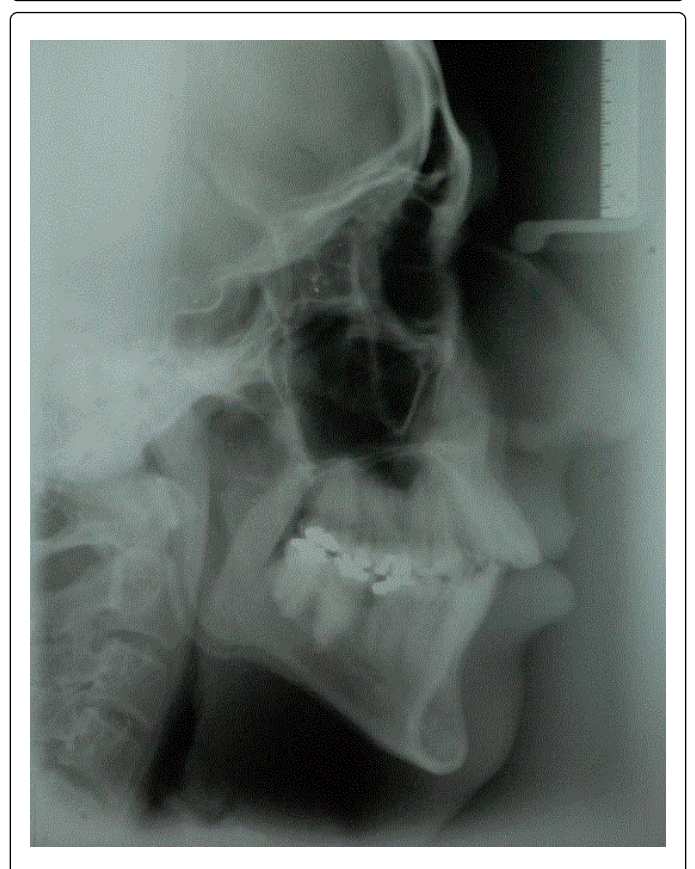
Figure 3: Lateral cephalometric radiograph showing the preoperative reduction of the nasal and oropharyngeal space.

Alignment and leveling of the upper arch was performed using surgically assisted maxillary expansion, without the involvement of the nasal septum. After 5 days, maxillary expansion was initiated using a Haas-type dental-mucus-supported expander appliance. Maxillary expansion was carried out for 40 days postoperatively, until a magnitude of 10.5 mm was achieved. The expander was retained in the upper arch for 6 months and was removed after radiographic confirmation of bone formation in the intermaxillary suture region.