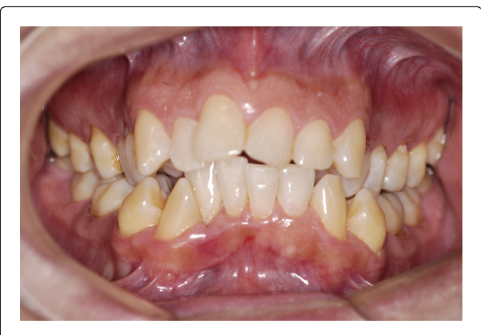
Figure 2: Frontal view of the patient's occlusion.