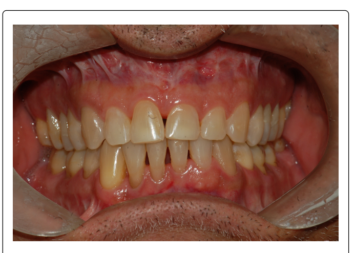
Figure 4: Front aspect of the occlusion after the removal of braces.

OSA is characterized by the total cessation of airflow for a period greater than or equal to 10 s [2], and the treatment goal is to reduce the frequency of occurrence of this obstruction. Several clinical symptoms allow the diagnosis of OSA and many of these symptoms could be observed in the current patient. Despite the typical clinical signs, polysomnography is considered the most reliable diagnostic technique to assess the achievement of OSA treatment goals [6].