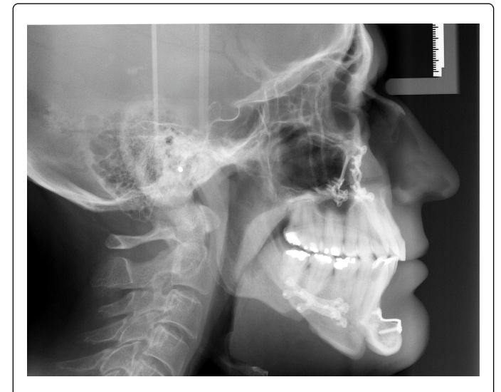
Figure 5: Lateral cephalometric radiograph showing an improved nasal and oropharyngeal space after the removal of braces.

Although various treatment modalities are available for OSA, some have disadvantages. Techniques such as CPAP and IOD depend on patient compliance and their efficacy might be compromised. CPAP has a precise indication and should be used by patients with moderate and severe OSA, as well as those who have no other immediate alternative treatment [5]. The long-term use of IODs has been associated with the appearance of malocclusions and TMDs [6].