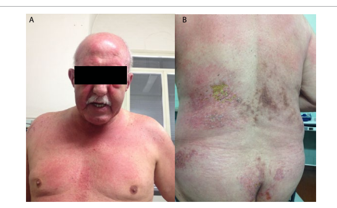
Figure 1: Clinical image Malar and facial dusky erythema associated to massive periorbital edema. Large erythematous lesions on the back, involving also the upper part of gluteus, with a pseudo-necrotic surface, sometimes with a yellowish colour

As known calciphylaxis (CPX) is a rare condition involving subcutaneous vascular calcification and cutaneous necrosis, mostly observed in patients with renal failure. However CPX may also appear in patients affected by polymyositis, Sjogren syndrome, Lupus