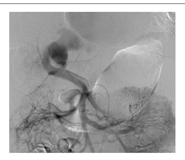
Figure 2: Mesenteric angiography.