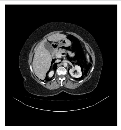
Figure 4: Extensive Amount of Retroperitoneal Air Displacing the Descending Colon Anteriorly

no contamination seen and only minimal amounts of pelvic free fluid identified. A laparoscopic aspiration and lavage was performed and tube drains left in situ as a precaution. The post-operative course was uneventful and she was discharged four days later.