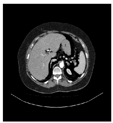
Figure 3: Axial CT Slice of the Upper Abdomen Demonstrating Pneumoperitoneum. Free Air Envelops the Retroperitoneal Structures