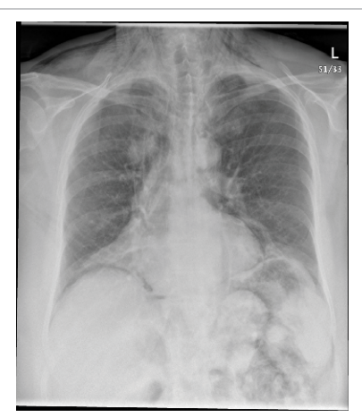
Figure 1: Chest X-ray Demonstrating Diffuse subcutaneous Emphysema and Subdiaphragmatic Retroperitoneal Free Air

The next day clinical examination revealed generalised abdominal tenderness with guarding and rebound tenderness. Surgery was decided in view of the spreading abdominal signs and a laparoscopy performed. Interestingly, laparoscopy was surprisingly normal, with