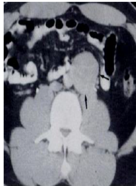
Figure 4: Abdominal CT-scan: abdominal recurrence.

immunoreactivity proved to be diagnostically useful, allowing, together with the absence of immunoreactivity for inhibin and melan A, an unequivocal diagnosis of catecholamine secreting tumors without discrimination between benign or malignant. To note, the mean count of sustentacular S-100 positive cells is lower in malignant than in benign pheochromocytomas [12].