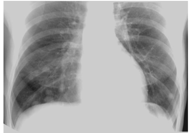
Figure 2: Chest X-ray: disseminated pulmonary nodules.