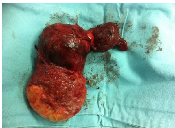
Figure 4: Total thyroidectomy specimen.

cancer. They work in hand with oncologists for subsequent detailed management. They would be able to delineate the exact location and extension during preoperative assessment. A written report is thus, mandatory. Although it is commonplace to order standard menus, it is up to the radiologists' discretion for the best techniques in particular problems.