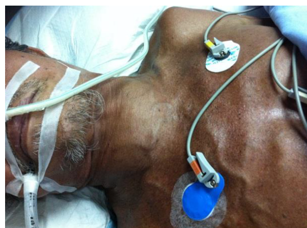
Figure 1: Preoperative picture showed huge thyroid swelling with dilated veins (arrow).

Imaging specialties are essential in the diagnosis and staging of