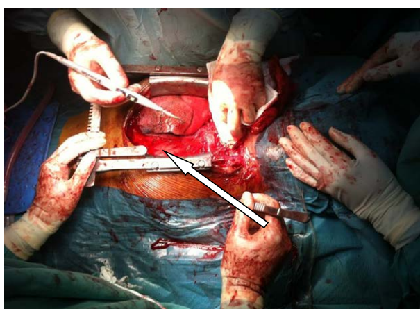
Figure 3: Sternotomy and mobilization of retrosternal goiter (arrow).