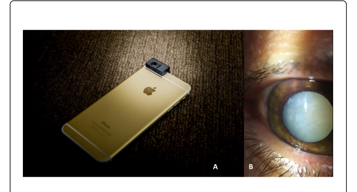
Figure 2: (A) 3D printed smartphone slit lamp microscope. (B) An image of a patient with a white cataract captured on a smartphone with the 3D printed slit lamp microscope.

Figure 1: (A) 3D printed retinal imaging adapter on a smartphone. (B) An image of a glaucomatous disc captured with the smartphone retinal imaging adapter. (C) An image of the same glaucomatous disc captured with a standard fundus camera