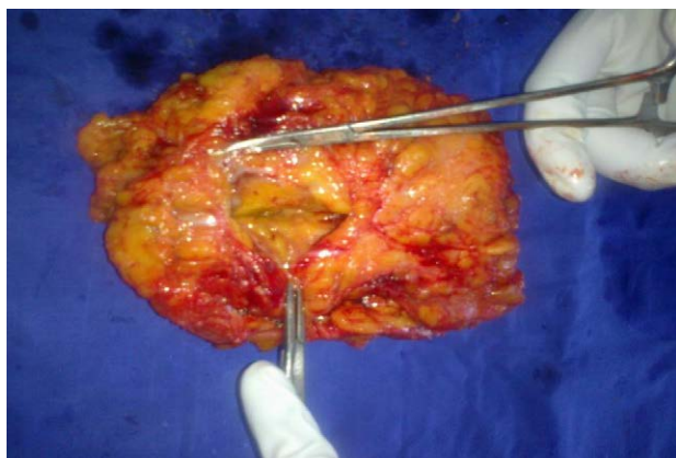
Figure 2: Macroscopic image in granulomatous mastitis; presence of abscess.