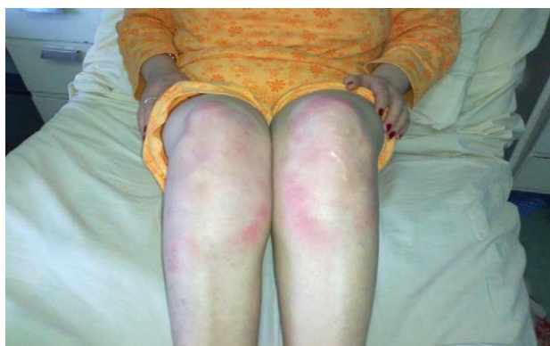
Figure 1: Peripheral vasculitis.

The drainage method is also still controversial in treating this disease because the incision wound does not heal easily and can leave a fistula tract, and treatment can last for an extended time. In our study, all the patients that underwent at the beginning with surgical drainage associated with antibiotics and/or corticotherapy presented long lasting treatment of the wound and early relapse. All the patients who underwent surgical excision as an initial treatment recovered faster, with an average recovery period of 6 days compared to the recovery periods for the other treatment methods that came up to 21 days.