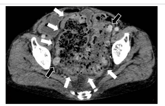
Figure 1: An abdominopelvic CT scan revealed a dilated sigmoid colon (white arrows) with multiple colonic diverticula (black arrows).

Obstructive colitis due to colonic diverticulitis was diagnosed