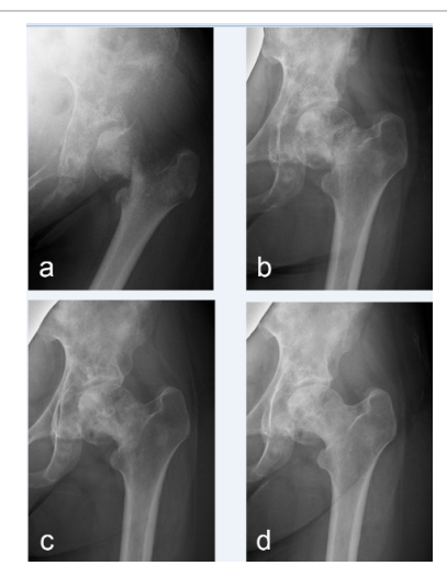
Figure 3: Dramatic changes in her left hip bone and femoral neck fusion after treatment. (a-d) Radiographic images. a: after a week of chemotherapy (On the 25<sup>th</sup> day from first visit). b: On the 160<sup>th</sup> day. c: On the 260<sup>th</sup> day. d: On the 342<sup>nd</sup> day (in out-patient clinic).

12.6 mg/L) and soluble interleukin-2 receptor (sIL2R: 875 U/ml). White blood cells (WBC: 7,900 cells/mm²) and serum QuantiFERON test was negative. Radiograph and computed tomography (CT) scan showed bone destruction in left hip bone and bilateral ilium (Figures 1 and 2), and these lesions showed low signal in T1-weighted imaging and inhomogeneous enhancement on T2-weighted imaging in enhanced MRI. Abnormal accumulations of radiotracer at the same lesions were seen by bone scintigraphy. Contrast enhanced whole body CT scan showed no other enhanced lesions. Electrophoresis of protein was normal, and a chromosome composition was 46XX.