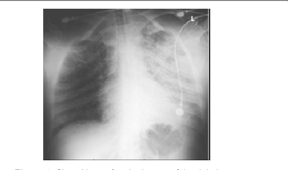
Figure 4: Chest X-ray after the lavage of the right lung.