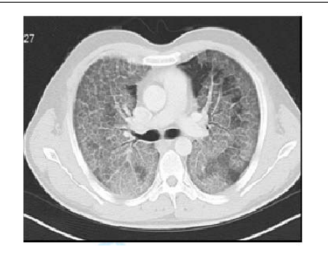
Figure 2: Bilateral ground glass and carzy paving appearance on CT.

Whole lung lavage is the standard palliative treatment for PAP. The goal is to remove the proteinaceous material deposited in lungs. Lung lavage was first performed by Ramirez Rivera in 1967 for the treatment