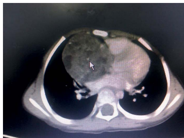
Figure 1: Chest computed Tomography with tumor. Inside the pericardium (arrow).

Teratomas are commonly classified using the Gonzalez-Crussi [8] grading system: 0 or mature (benign); 1 or immature, probably benign; 2 or immature, possible malignant (cancerous) and 3 or frankly