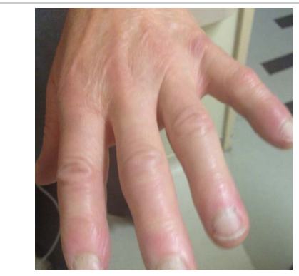
Figure 1: Metacarpal phalangeal joints, proximal interphalangeal joints and distal interphalangeal joints were erythematous, swollen and tender bilaterally. He had a maculopapular rash on the dorsal surface of his hands bilaterally and periungual erythema.

A repeat contrast CT scan of the chest showed (Figure 2) moderate and severe opacity in the right middle lobe and lower lobe respectively, with some traction bronchiectasis. Mild subpleural reticulation in the left upper lung, moderately severe opacity in the lingula and left lower lobe. Normal airway anatomy was observed on fiberoptic bronchoscopy. Bronchoalveolar lavage (BAL) fluid examination ruled out infection. The BAL differential cell count revealed: 39% neutrophils, 1% lymphocytes and 60% bronchial lining cells. Pulmonary function testing (Table 2) was consistent with severe restrictive lung disease. A structurally normal heart, ejection fraction >55% and estimated