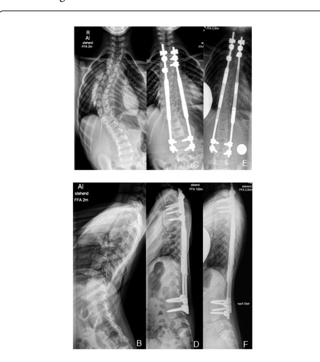
Figure 2: 6-year-old girl with an undefined muscle disease (A-B) preoperative view, (C-D) after MCGR-implantation, (E-F) 42 months follow up.

kyphosis, three of them had to be revised. All of them were relatively rigid and had a preoperative kyphosis of more then 50°. One patient had a migration of screws, one a late deep infection and one a lumbar adding on which was resolved by revision and inclusion and instrumenting two more additional lumbar levels.