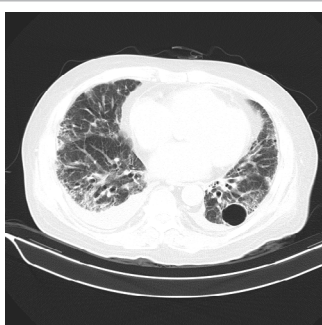
Figure 2: Chest HRCT showed honeycombing, scissural distortion and ground glass opacities in the bases and the periphery of the lungs.